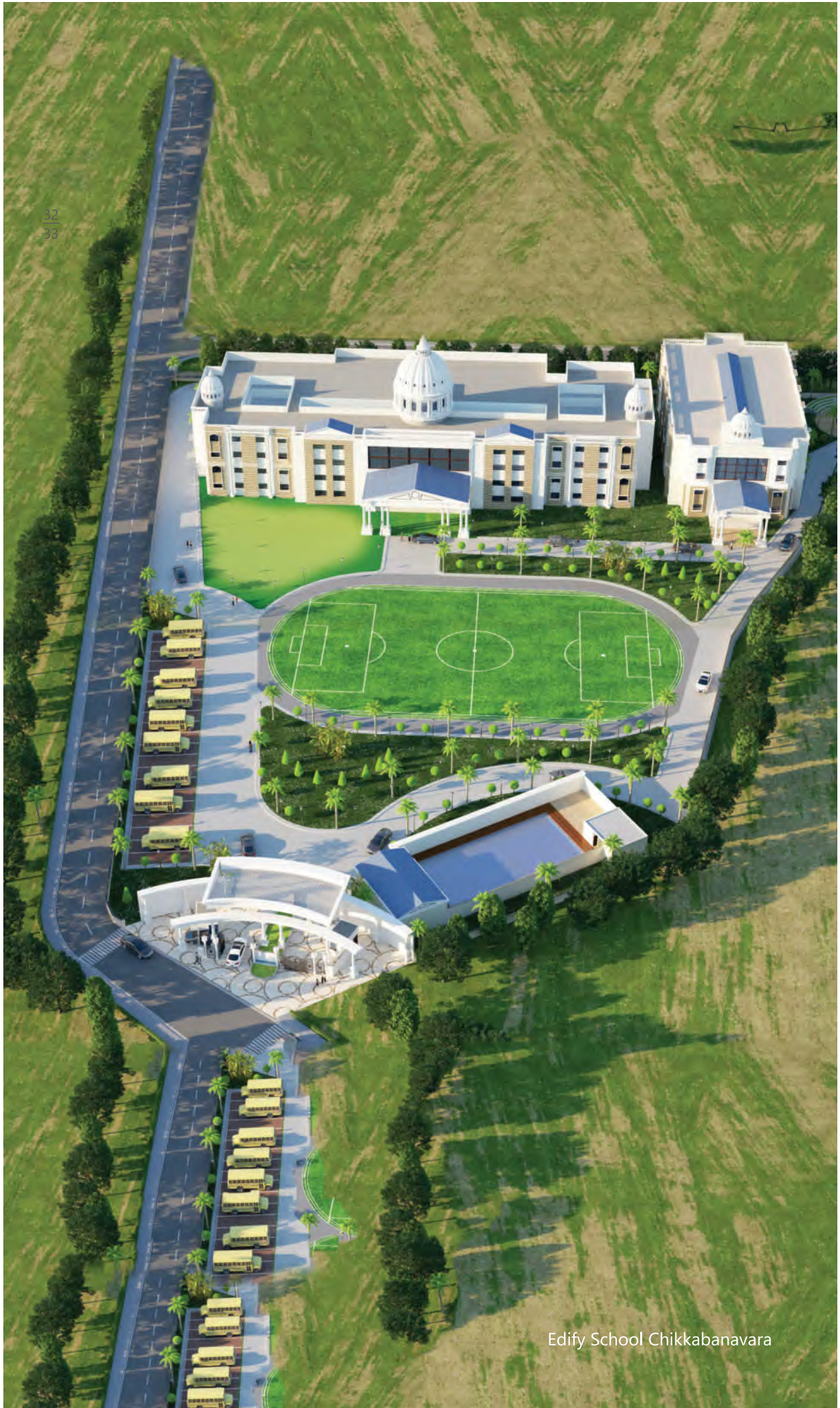
Edify School Chikkabanavara